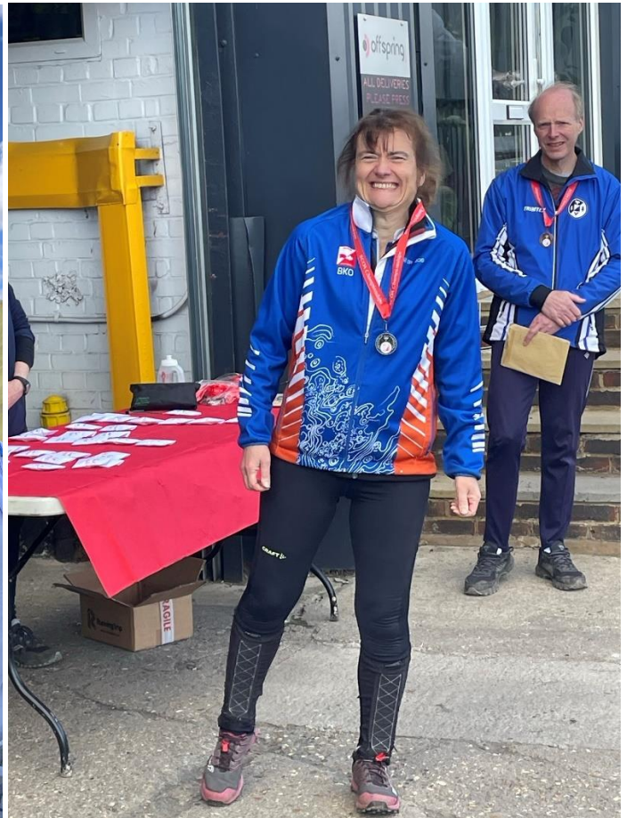
BKO Local Event – Mortimer Saturday 27 th April 2024